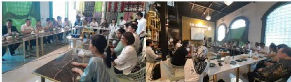
Figure 4. Lunch and discussion with IPMI International Business School and prospective scholarship recipient schools.

In its effort to increase access to higher education, IPMI International Business School offers 5 special scholarships for its Bachelor of Business Administration program, which lasts for four years or eight semesters. These scholarships cover the student's entire academic journey and provide significant financial support. This move is part of IPMI's goal to create an inclusive and sustainable educational environment that allows students to focus on developing their knowledge and skills without worrying about financial matters. In addition, IPMI offers one additional scholarship for the MBA program, which allows students to pursue a postgraduate degree in Business Administration. The program lasts for 4 semesters, or about 18 months, and is aimed at those who want to improve their managerial skills and gain a deeper understanding of the business world. This decision demonstrates IPMI's commitment to assisting the career development of aspiring leaders.