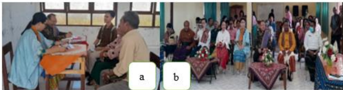
Figure 1. a. Selection process of scholarship recipients by IPMI International Business School. b. Socialization at the target schools.