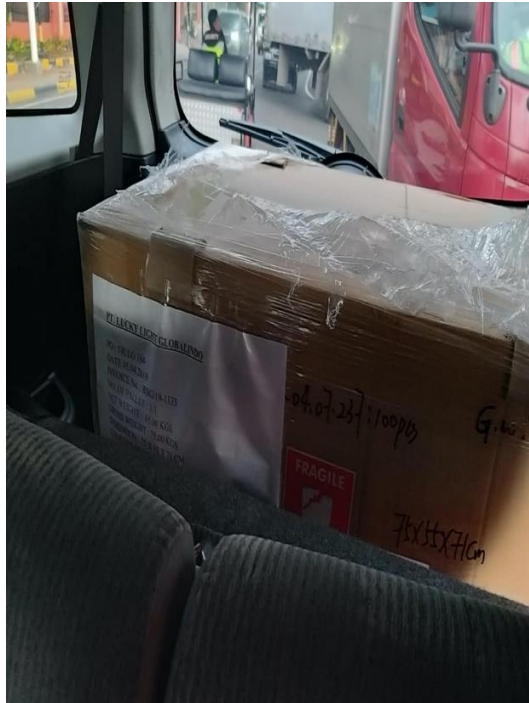
Figure 3: Delivery goods of Lucky Light Globalindo, while survey.