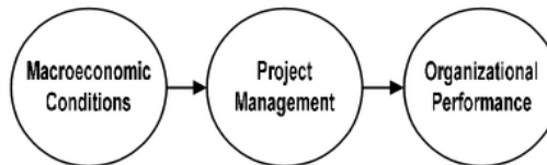
FIGURE 1: Research Model

For the purpose of this study, data was gathered previously, immediately following the preliminary studies in project management and entrepreneurship (Anantadjaya and Mulawarman, 2010). The period of coverage in this study spans from 2009-2012 (only the first quarter). As noted in the preliminary studies, Firm A is an automotive firm in Indonesia that manufactures vehicles, distributes vehicles and spare-parts. Its production plant is located in the outskirts of Jakarta. Firm A is a foreign direct investment firm, and it is the sole agent, assembler, and manufacturer of a certain brand of vehicle. For the purpose of this paper, after-sales services (spare-parts) become the focus in trying to learn the causes of project overrun, including the likelihood on operational and asset inefficiency. In addition, this study also relies on information obtained from locally owned automotive firms, mainly focusing in body shops and engine overhaul works. Those locally owned firms are; Firm B, Firm C, and Firm D, which are all located in Jakarta and Bandung. Aside from noting the differences in handling project management in a foreign direct investment firm and