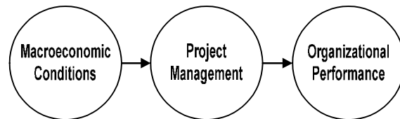
FIGURE 1: Research Model

For the purpose of this study, data was gathered previously, immediately following the preliminary studies in project management and entrepreneurship (Anantadjaya and Mulawarman, 2010). The period of coverage in this study spans from 2009-2012 (only the first quarter). As noted in the preliminary studies, Firm A is an automotive firm in Indonesia that manufactures vehicles, distributes vehicles and spare-parts. Its production plant is located in the outskirts of Jakarta. Firm A is a foreign direct investment firm, and it is the sole agent, assembler, and manufacturer of a certain brand of vehicle. For the purpose of this paper, after-sales services (spare-parts) become the focus in trying to learn the causes of project overrun, including the likelihood on operational and asset inefficiency. In addition, this study also relies on information obtained from locally owned automotive firms, mainly focusing in body shops and engine overhaul works. Those locally owned firms are; Firm B, Firm C, and Firm D, which are all located in Jakarta and Bandung. Aside from noting the differences in handling project management in a foreign direct investment firm and