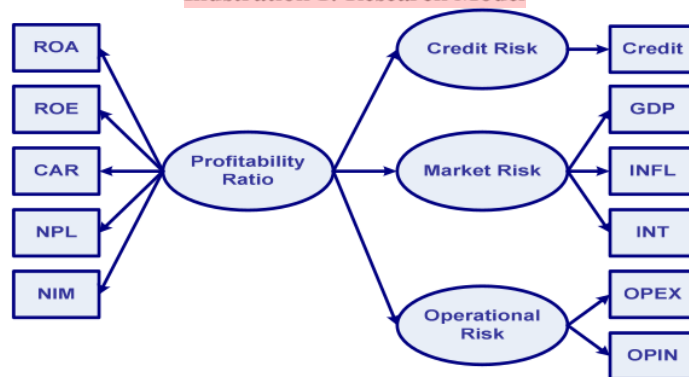
Illustration 1: Research Model

The illustration above describes the research model of this study. On the left, profitability ratio is stated as the independent variable in this research, and multiple risk factors are the dependent variables. Profitability ratios used for this research are return on assets ratio, return on equity ratios, capital adequacy ratios, non-performing loans ratios, and net interest margin ratios of banks. However, to support the risk management as the Y factor,