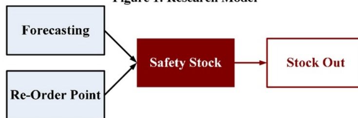
Figure 1: Research Model

However, the safety stock calculations are influenced by the forecasting, because the safety stock level is determined based on a forecasting calculation. Not only that, but also re-order point can determine the safety stock level. Based on the figure above, the author can make the proposition as follows: