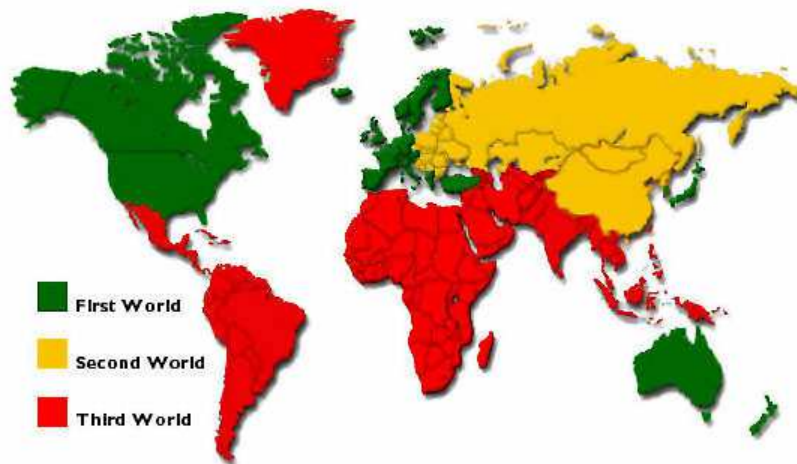
Figure 1: Three World Model