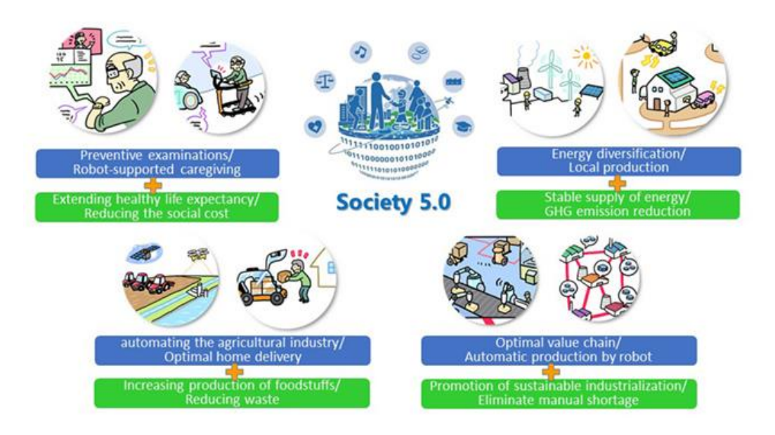
Figure 2. Community Example 5.0

product or service to be made to solve the issue of the case or not, and if resolved the case, how much and how useful the result.