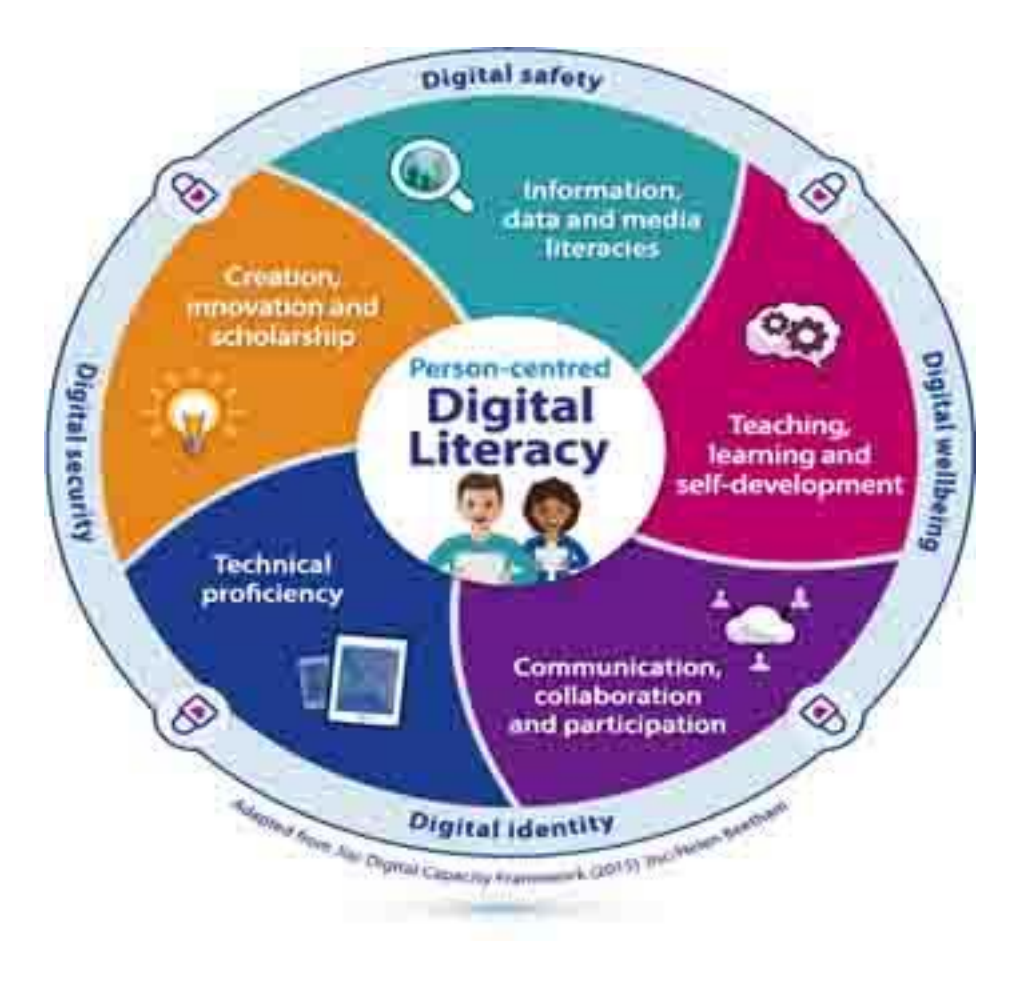
Figure 2: Digital Competency Literacy(Ilomäki et al., 2011)